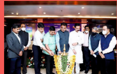
Mangaluru Technovanza October 2021