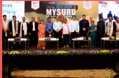
The Big Tech Show @ Mysuru October 2021