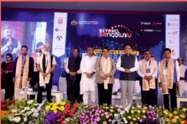
Impact & Innovation @ Hubballi October 2021