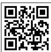
Embroidery Machine Training video

From ideation to execution, we incorporate rigorous process in empathizing, brainstorming and coming up with novel products and solutions. In addition to this, our state-of-the-art facility bring to you embroidery, printing, sewing machines, space management, furniture design, color scheme and more to turn all ideas into products that speak a thousand words.